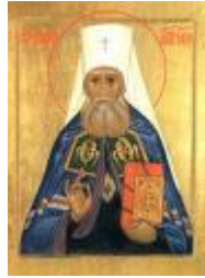
Saint Philaret of Moscow