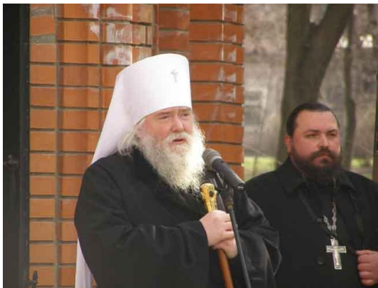
METROPOLITAN AGAFANGEL BEFORE CONCERT