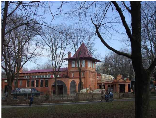
ROCA DIOCESAN RECTORY, ODESSA, 2009