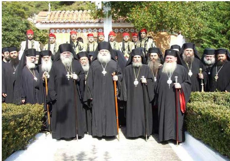
BISHOPS IN ATHENS

Bishop Agathangel of Taurida & Odessa participated in the celebration of the patronal feast of the monastery of the Holy Martyrs Cyprian and Justinian in Athens, Greece. The services were led by the Most Reverend Bishop Cyprian (for the ailing Metropolitan Cyprian, hierarch of the Old Calendar Church of Greece). In attendance also were the Most Reverend Metropolitan Vlasie, hierarch of the Old Calendar Church of Romania, and the Most Reverend Metropolitan Photii, hierarch of the Old Calendar Church of Bulgaria. There were also 16 other bishops who celebrated the liturgy.